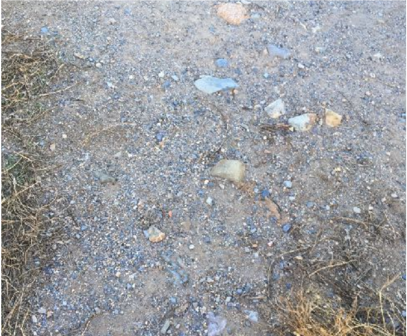
Ground before manually chipping with 16lb digging bar.

Final Project Soil Food Web School Sonoran Desert garden Photo Log