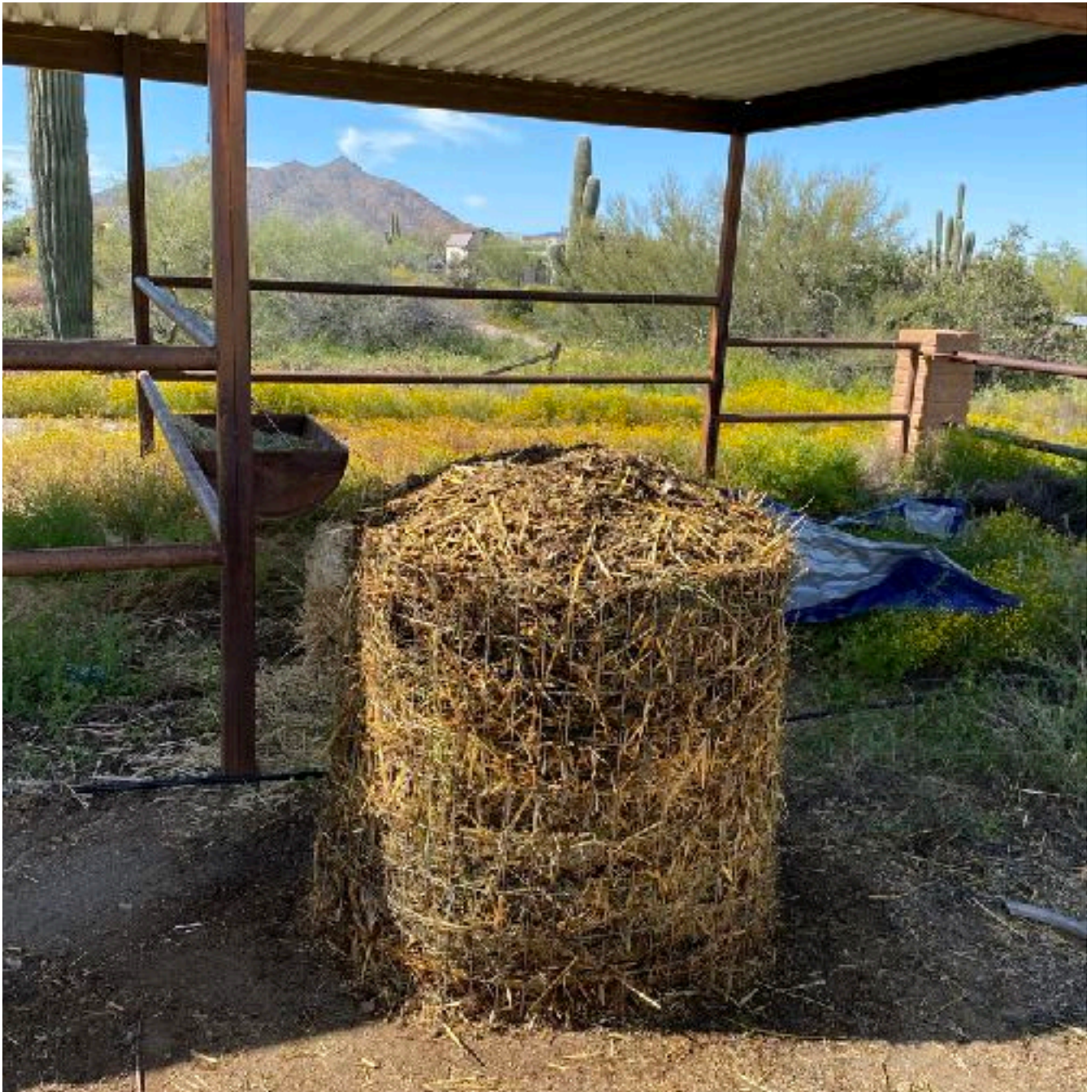
Second Compost Pile started.