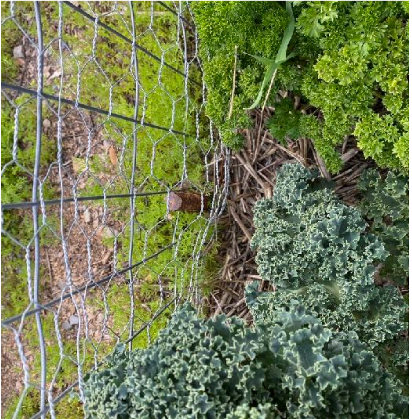
Globe Chamomile thick just on the opposite side of the fence. Hardly a sprig in the garden.