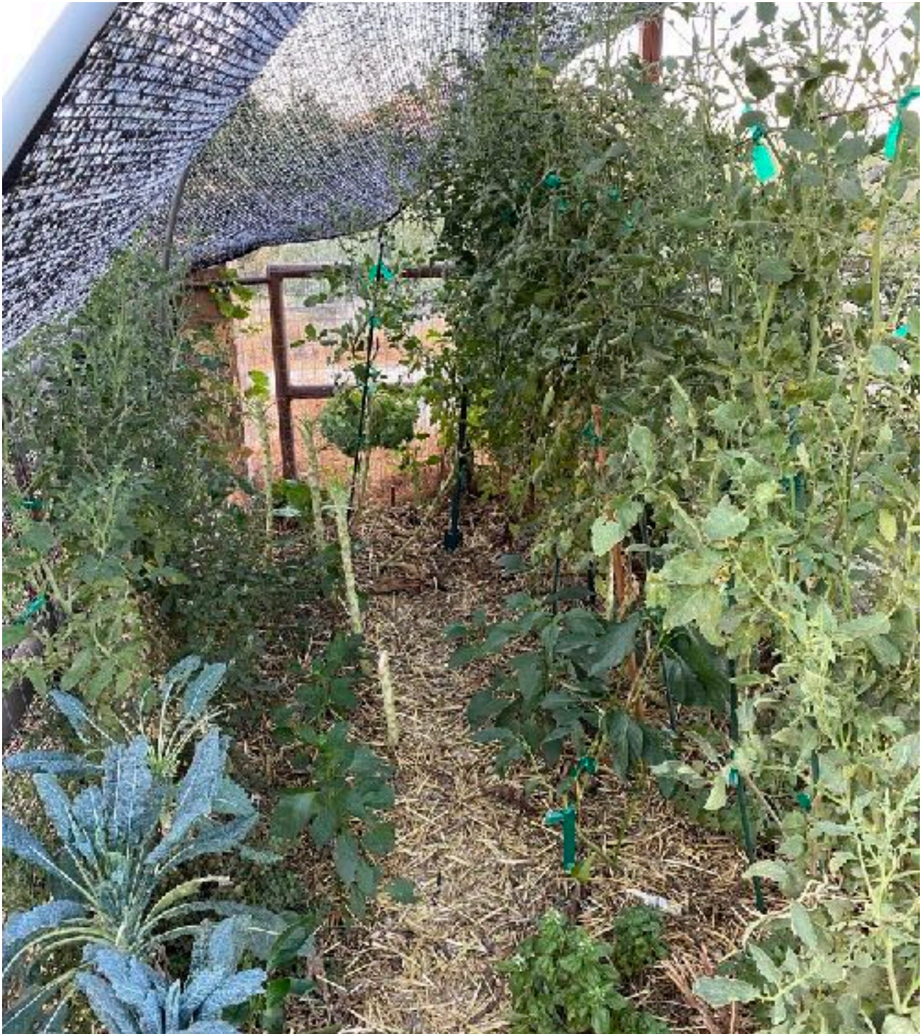
Summer veggies. Tomatoes, basil, eggplant, peppers of all sort, herbs, okra and cucumber.