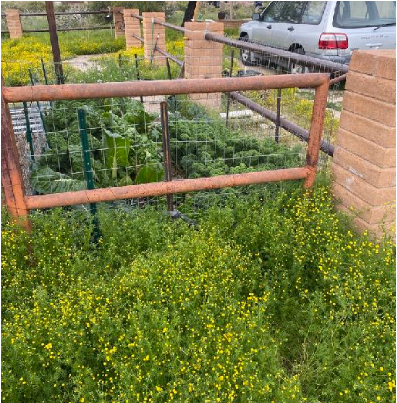
Globe Chamomile is setting seed.