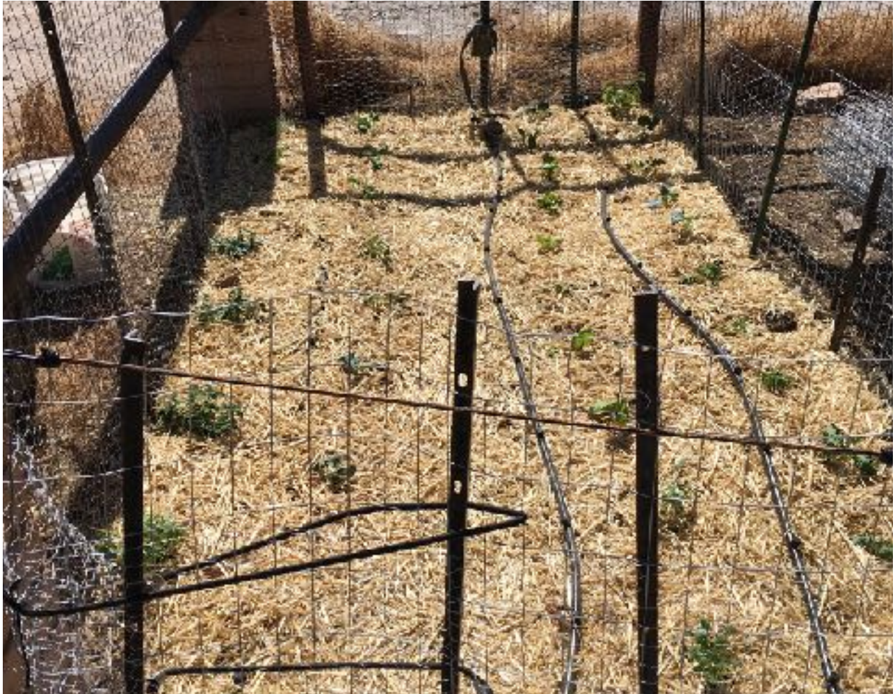
Winter crops were planted.