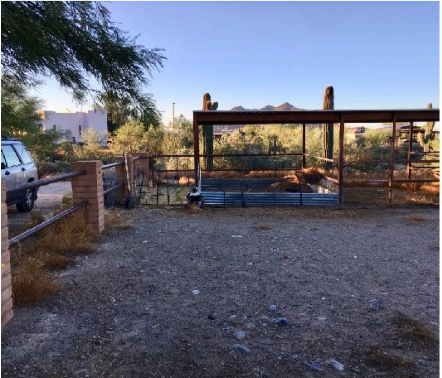
Garden, Left Middle. Showing garden surroundings. To right of garden with corrugated metal barrier is a Sonoran Desert Tortoise enclosure. The whole area was a Horse Turnout. The covered areas were stables.