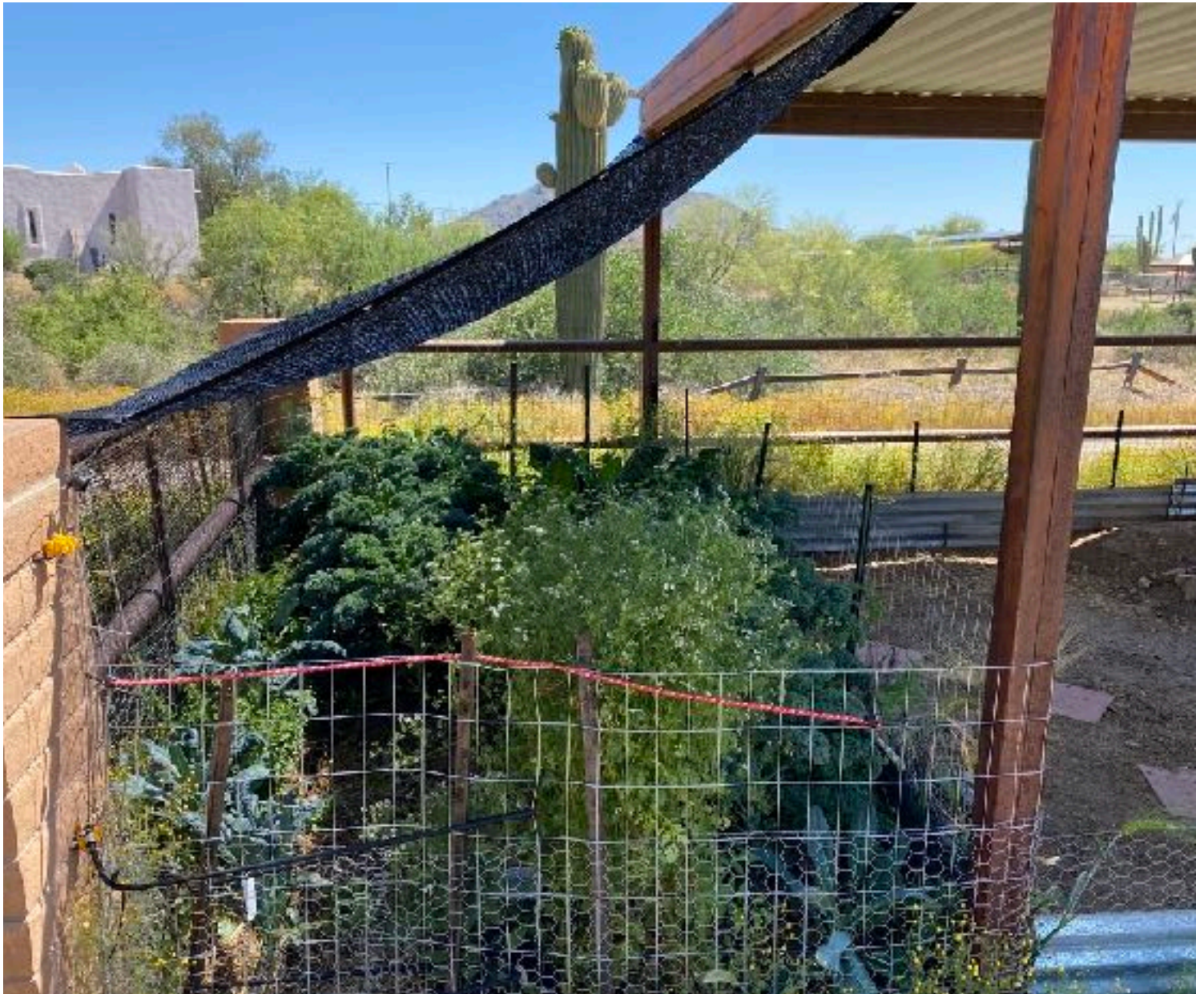
Shade cloth installed. Tomatoes and Peppers are planted in the understory of the winter crop.